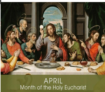
APRIL Month of the Holy Eucharist